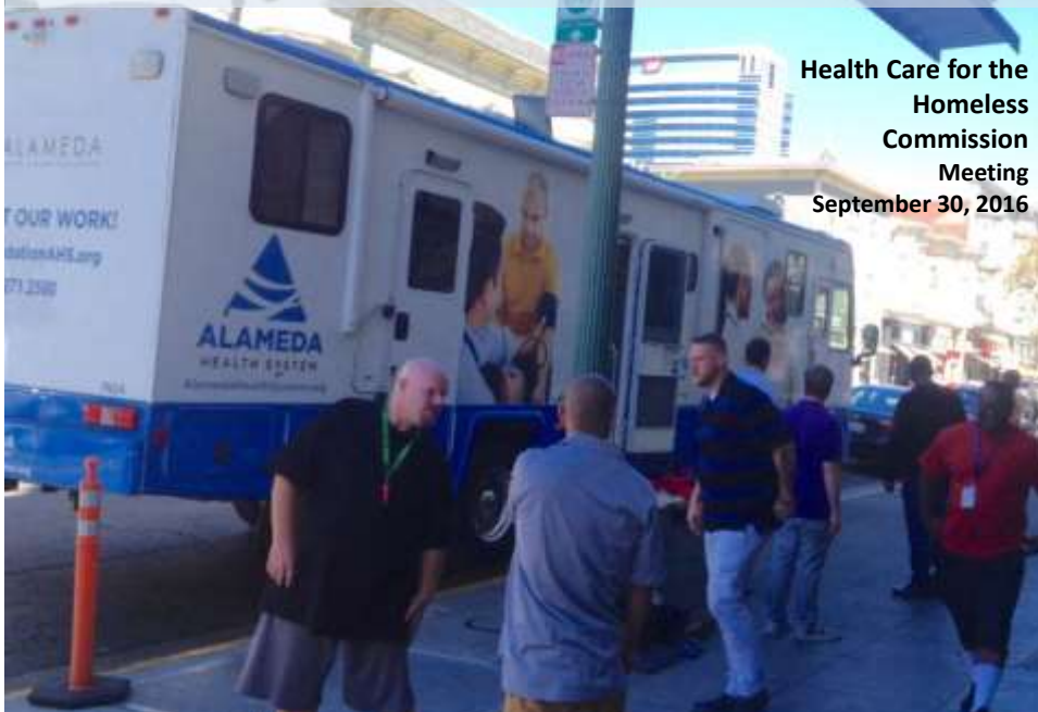
Health Care for the Homeless Commission Meeting September 30, 2016